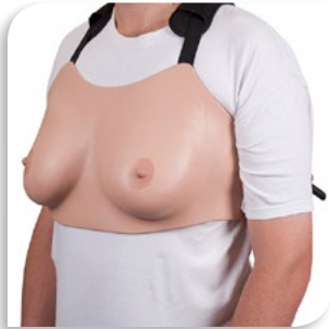
Breasts can be worn by a simulated patient (male or female)