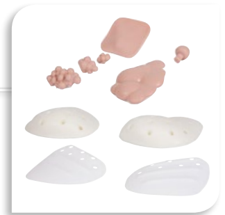
Pathologies are supplied and fit securely into the holes in the Pathology Supports & Back Plates